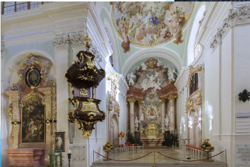
“Our Lady of Maryzell Cathedral”

Mariazell Basilica, also known as Basilica Mariä Geburt, is a Roman Catholic church building in Mariazell, Austria. It is the most important pilgrimage destination in Austria and one of the most visited shrines in Europe. In the church, a miraculous wooden image of the Virgin Mary is venerated.