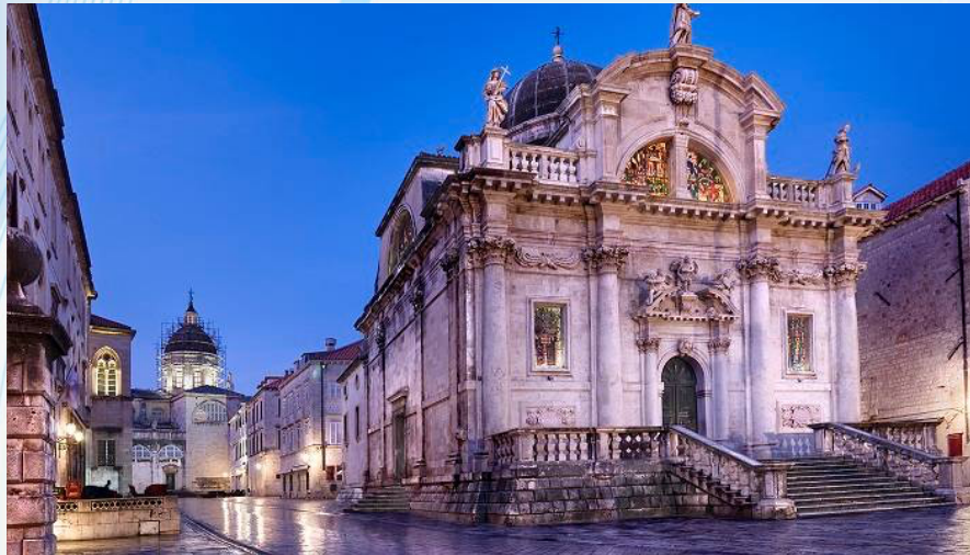
“St. Blaisius Cathedral”

One of the most beautiful sacred buildings in Dubrovnik, St Blaise's Church today. Saint Blaise has been honored as the patron saint of Dubrovnik since the 10th century. According to Dubrovnik chroniclers, Saint Blaise saved the people of Dubrovnik in the 10th century when the Venetians anchored their ships in Gruž. and in front of Lokrum Island. The people of Dubrovnik believed in the Venetian assurances that they would leave for the Levant after they provided their own food and drink.