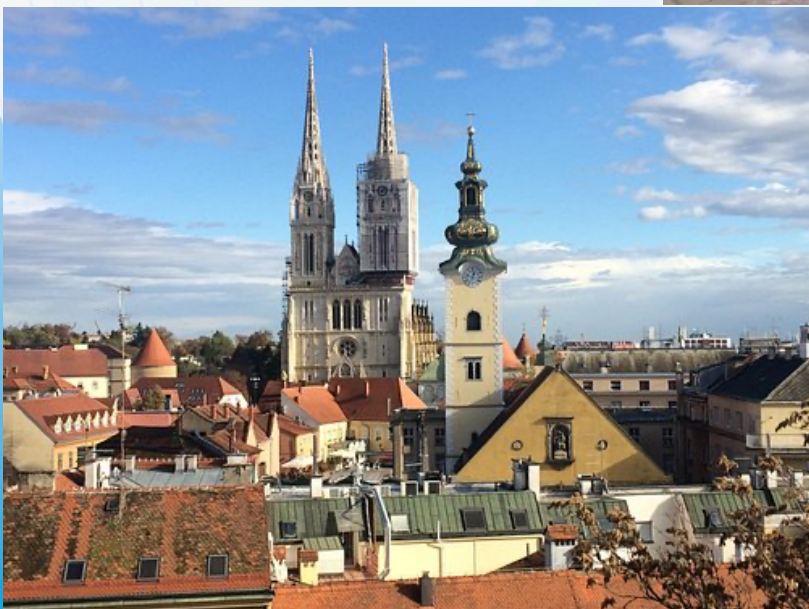
"Church of Zagreb"

It is the second tallest building in Croatia and also the most majestic sacred building in Gothic style in the southeast of the Alps. It is dedicated to the Assumption of Mary and the kings Saint Stephen and Saint Ladislaus. The church is usually Gothic in style, as well as its sacristy, of great architectural value.