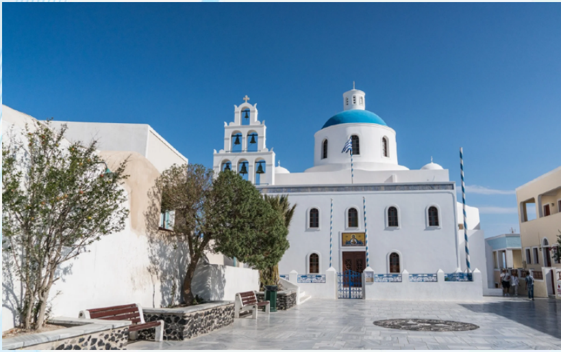
Church in the city of Athens

Where St. Paul preached to the Greeks and they did not receive him